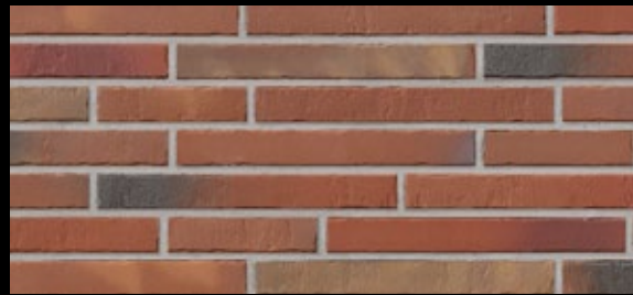
Glanzstück № 2 Δ < 3 % · DIN EN 14411, Gr. A b