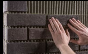
Use a string to plumb the clinker area. The clinker slips are pressed into the adhesive bed.