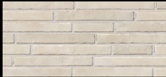
Glanzstück № 4 Δ < 6 % · DIN EN 14411, Gr. AII a - Part 1