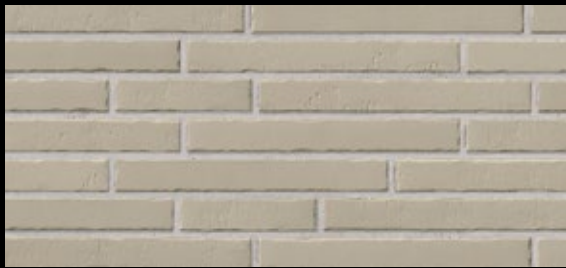
Glanzstück № 3 Δ < 6 % · DIN EN 14411, Gr. AII a - Part 1