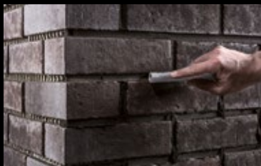
Jointing with a trowel allows you to create different looks.