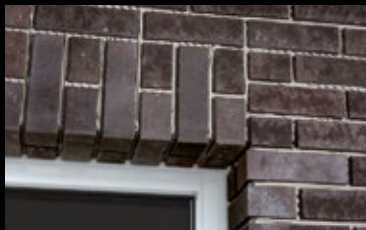
Window lintel perfectly replicated with angles.

JOINTING: After applying the clinker slips and after a corresponding drying time (see the adhesive manufacturer's instructions), a start can be made on grouting. Clinker slips with smooth surfaces can be processed by the slurry method. There are a number of grouts on the market but some have plastic and pigment additives. For this reason, you should always consult the mortar manufacturer regarding suitability before choosing the grout. All rough, patinated and textured surfaces are grouted with a conventional pointing trowel and a metal float.