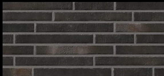
Glanzstück № 6 Δ < 3 % · DIN EN 14411, Gr. A b