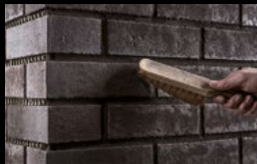
Sweeping out the joint gives it a corresponding structure.