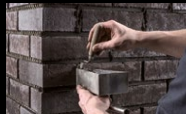
The vertical joints can be finished more easily with a smaller pointing trowel.