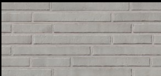
Glanzstück № 7 Δ < 3 % · DIN EN 14411, Gr. A b