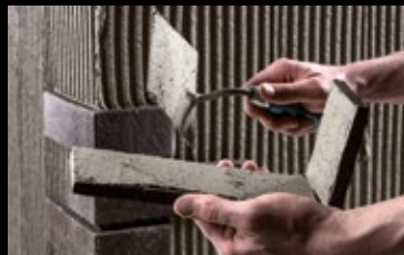
The corner angles are worked using the floating-buttering method.