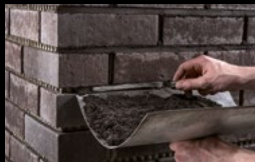
Grouting using pointing trowel and metal float along the horizontal.