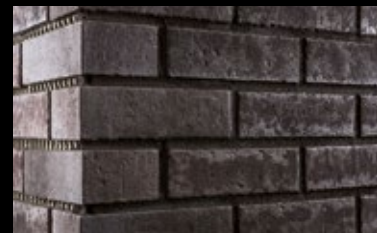
The finished joint pattern. Full masonry stretches are grouted at one go.