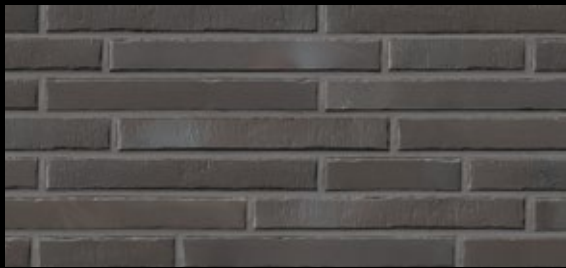
Glanzstück № 1 Δ < 3 % · DIN EN 14411, Gr. A b