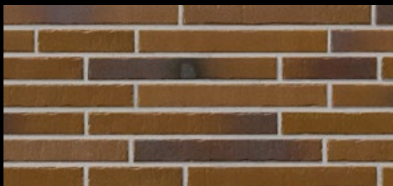
Glanzstück № 5 Δ < 6 % · DIN EN 14411, Gr. AII a - Part 1