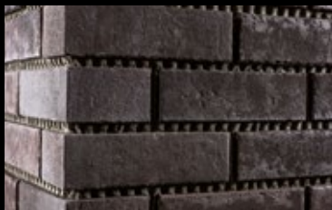
The finished surface. Grouting can be done after the appropriate drying time.